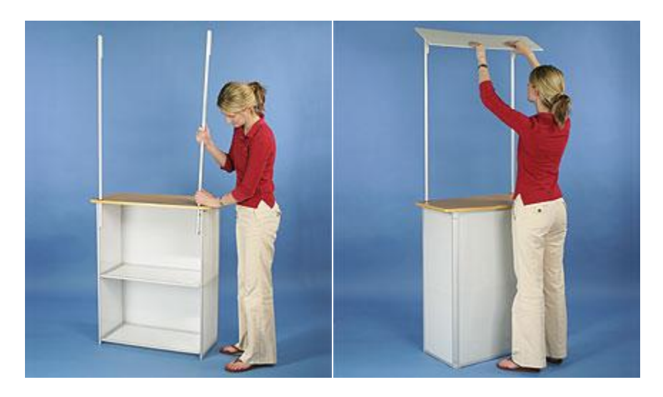
Attach the Velcro<sup>®</sup> header to the tops of the poles.

Insert each pole into the two holes in the countertop. Be sure that the Velcro<sup>®</sup> patches on the poles face front to hold the header. Line up the holes in the poles with the screws in the plastic frame. See picture left. Insert the screws into the holes, and then push down on the poles to latch them firmly in place. You may also need to push in on the plastic sides to make sure these pieces are properly connected. Once they are, your countertop will be securely attached to the frame.