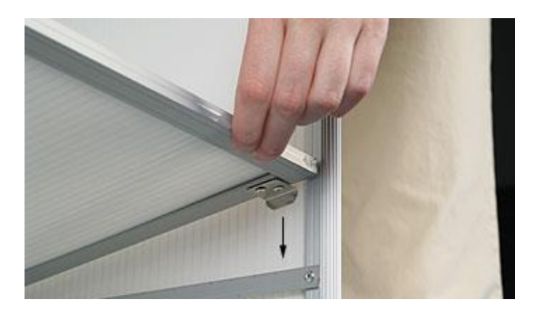
Next, attach the two shelves to the inside of the display. Hooks on the shelves connect to the support rails as shown above.