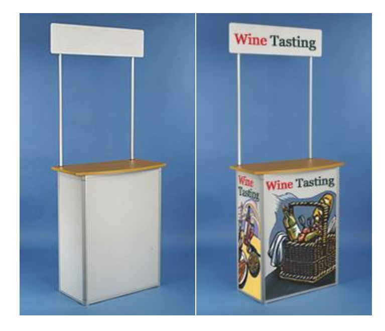
These instructions apply to promotional counters with and without vinyl graphics. (Vinyl graphics come pre-installed onto the PROMXMNGR counter.)